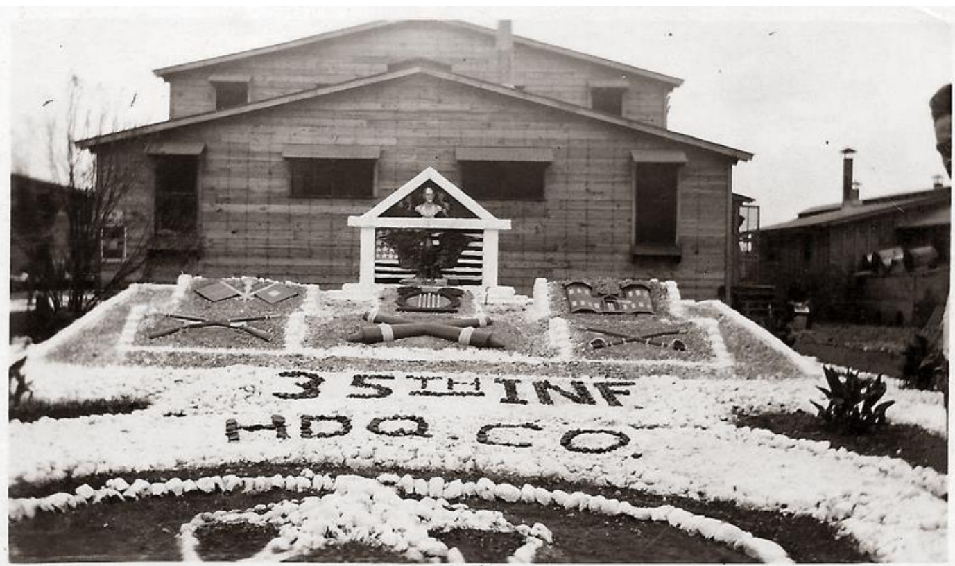
Headquarters 35 th Infantry Regiment at Camp Stephen D Little, AZ 1918