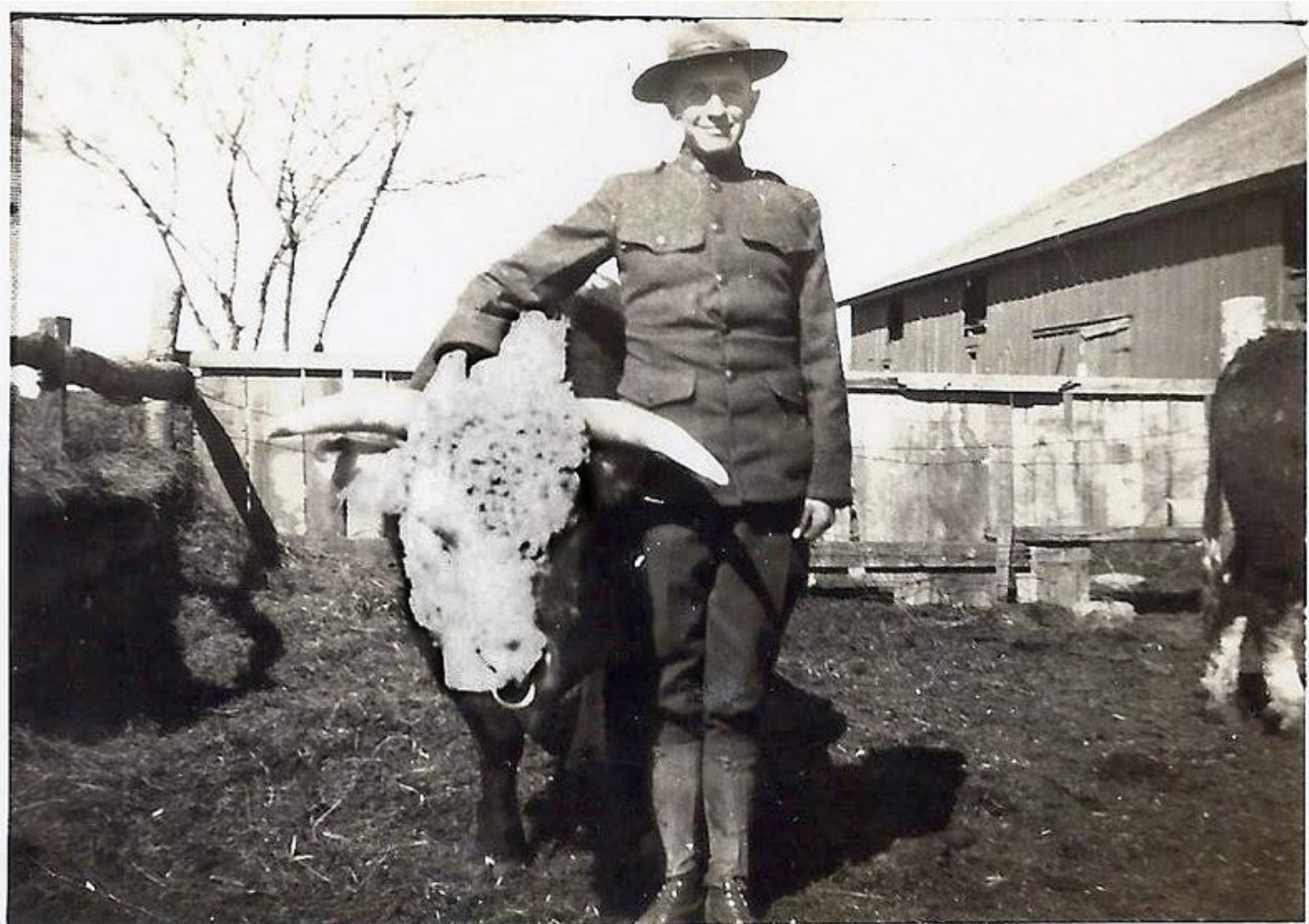
Uncaptioned, but looks to be at the stockyard for the Camp.