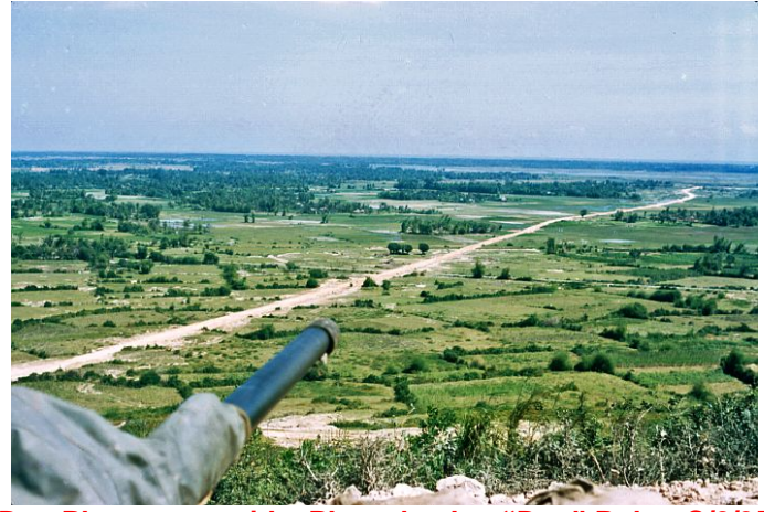
Duc Pho countryside.

9. Mission: 2/35 Inf TF under OPCON 2d Bde, 1<sup>st</sup> Cav (Airmobile) was to conduct search and destroy operations in AO LeJeune and provide ready reserve force for the operation. A/2/35 assumed responsibility for initial RRF at 160730H April 1967. B/2/35 was to provide security on the western flank of Operation Golden Fleece, a rice harvest project designed to protect the local population from guerrilla activity in the harvest area. On order, conduct search and destroy operations to the north.