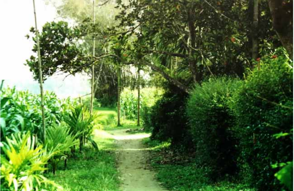
Hedgerows and trees separate villages and individual houses providing numerous hiding places.

Teams were dispatched to the scene and brought indirect fire into the area. Again the enemy disappeared into their spider holes and tunnels saturating the fields, hedgerows and surrounding tree lines.