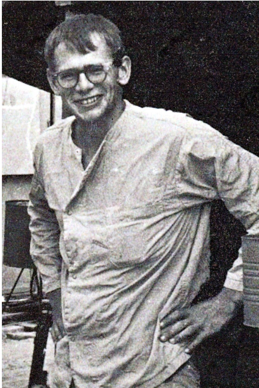
In the hospital with malaria

The crowd erupted with cheers and cat-calls. All the young bucks were fired up just being close to so many attractive young women. I stole a glance at the two buddies who had so recently had their circumcisions. They appeared in pain, pulling and adjusting their crotches.