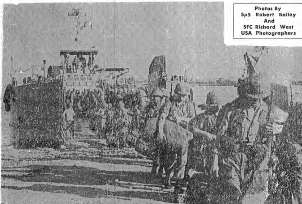
The approximately 3,300 troops of the 3rd Brigade come ashore at Vung Tau. Their arrival upped U.S. Forces in Vietnam to 325,000 men.