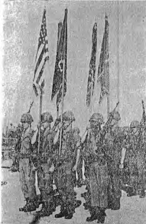
First ashore from the 4th Division's 3rd Brigade were the colors.

The brigade, formed in October 1963, is composed of three infantry battalions, one artillery battalion, one cavalry troop, and organic supporting elements.