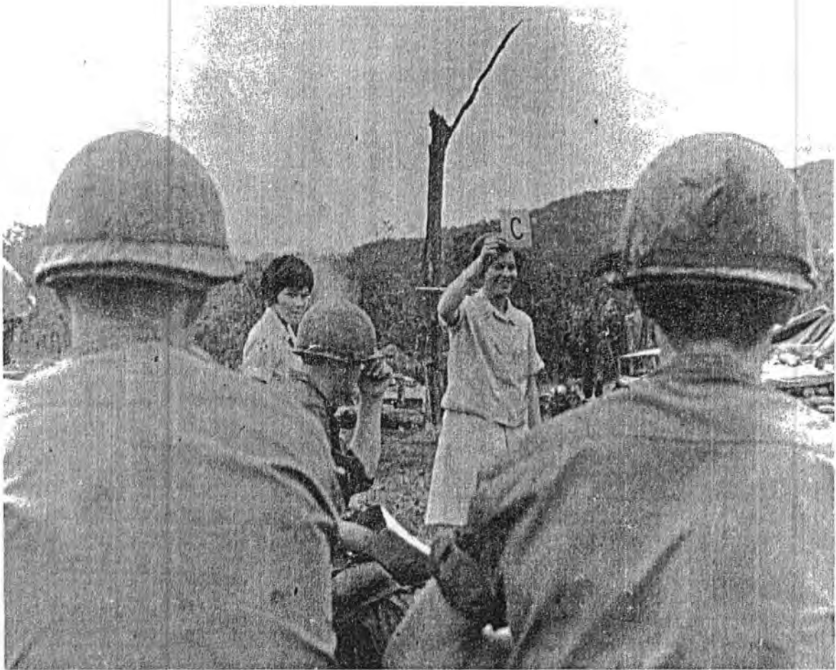
A MOMENT'S DIVERSION FROM THE FATIGUE OF COMBAT CAN MEAN A LOT AS THE IVY DIVISION'S RED CROSS GIRLS ENTERTAIN

i, it will always mean the NKS" relayed across the Vest!" from a lot of grateful