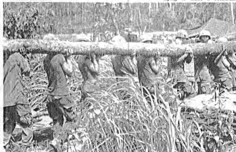
HEAVE-HO — Men of the 1st Battalion, 22nd Infantry bring a huge log into their fire support base during a bunker-building project. The Ivymen specialize in overhead cover for protection from the enemy's frequent mortar attacks.

Regardless of who was first in Vietnam with it, the men of the Support Platoon, Headquarters Company, 3rd Battalion, 8th Infantry do try harder. They realize their key importance in the smooth operation of the battalion.