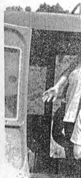
GIRLS FROM RED CROSS CLUB