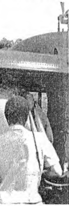
MOBILE BOARD A HELICOPTER