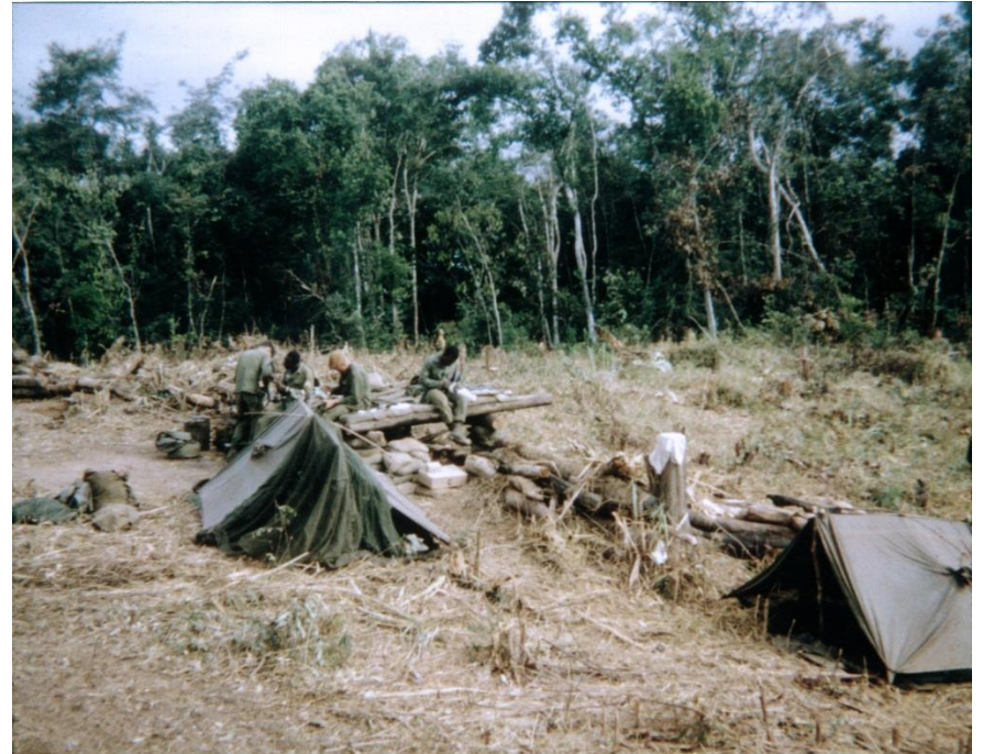
open field Iz unk?