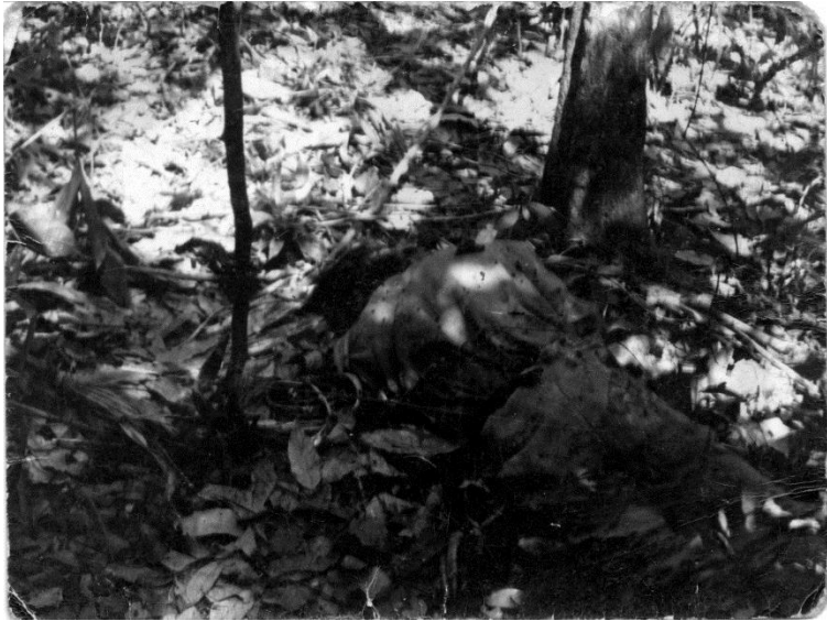
dead NVA from Mar 12