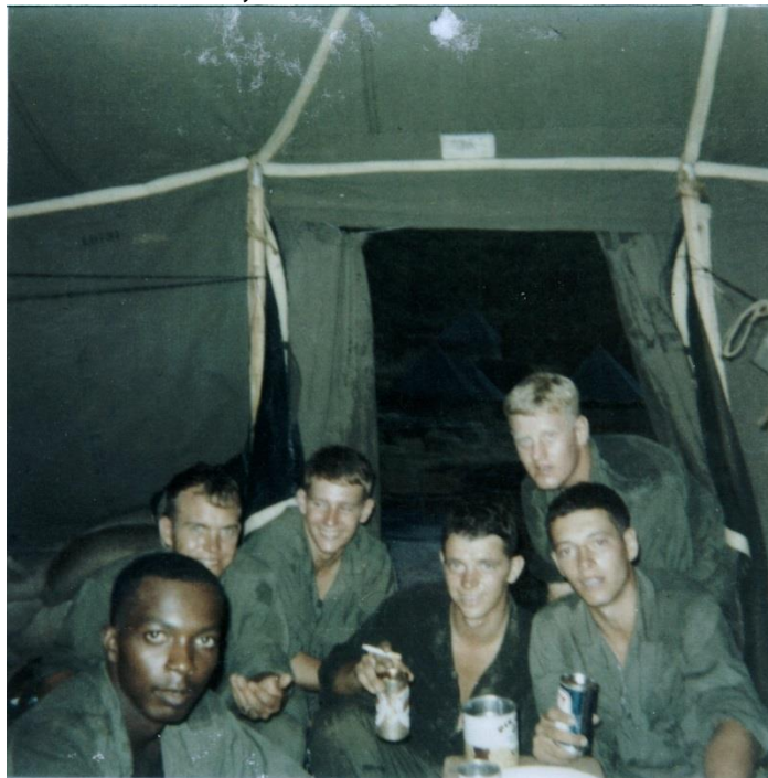
Duc Pho June 6