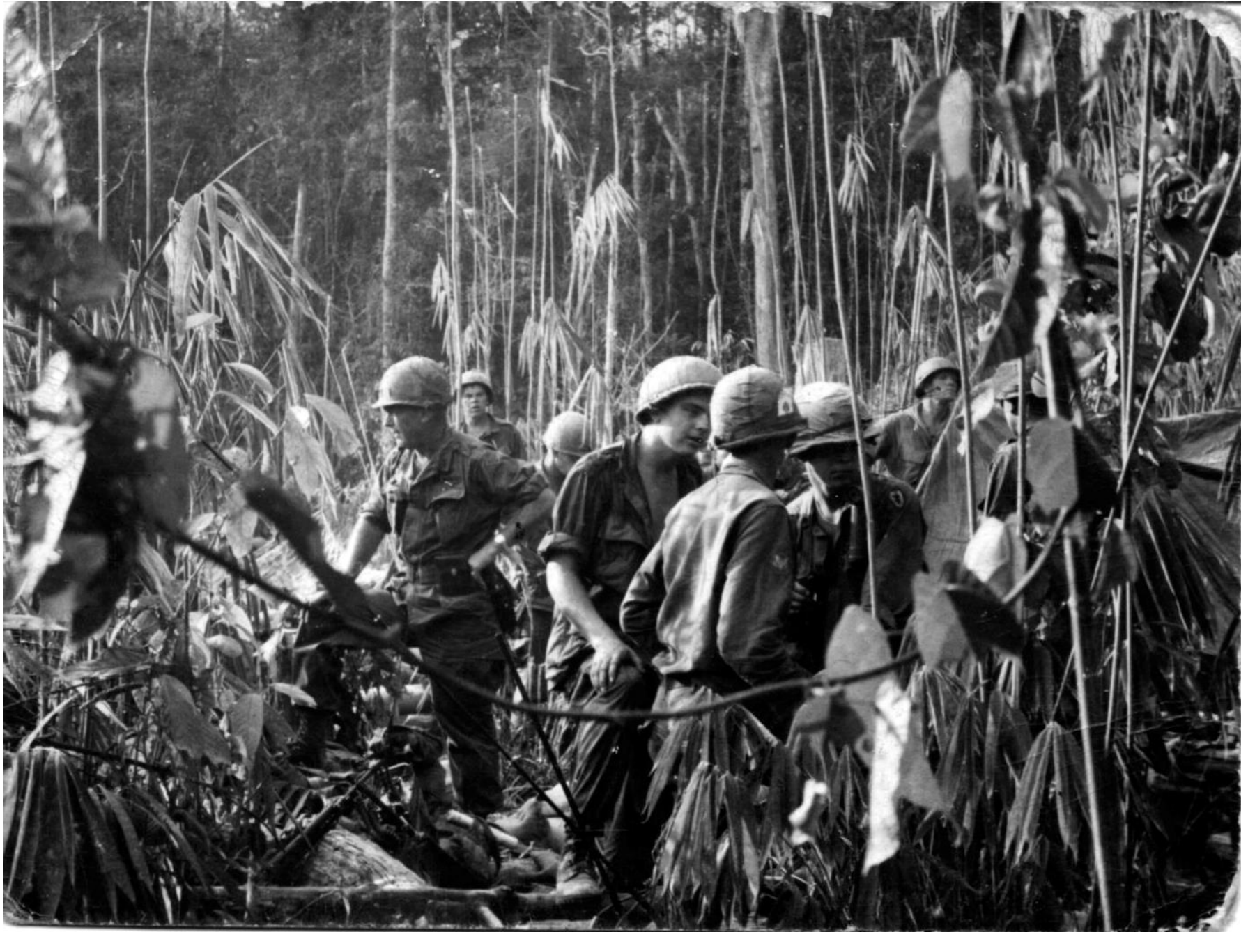
Mar 13, the day after the big firefight in which 2-35 killed 280 NVA soldiers (arrow is my buddy who killed the Charlie in the other picture)