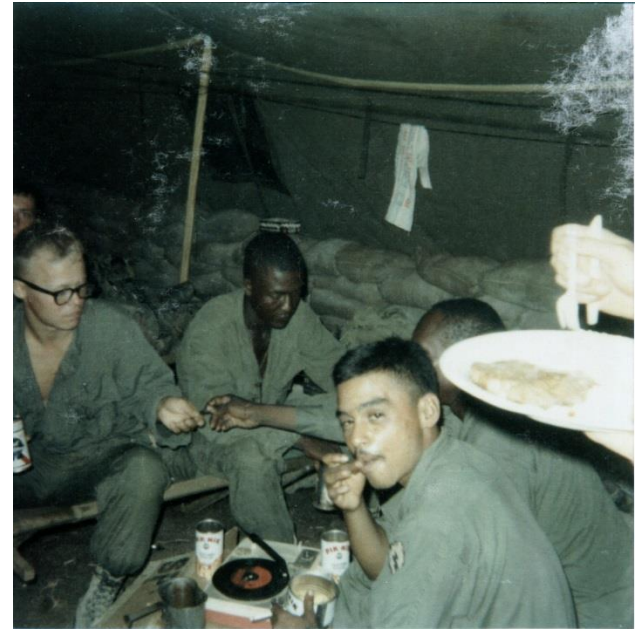
Duc Pho, June 67, in from field