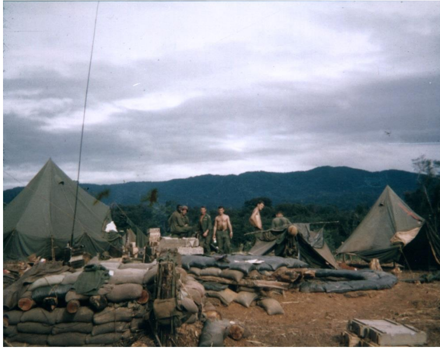
Iz unk? Tents and bunkers