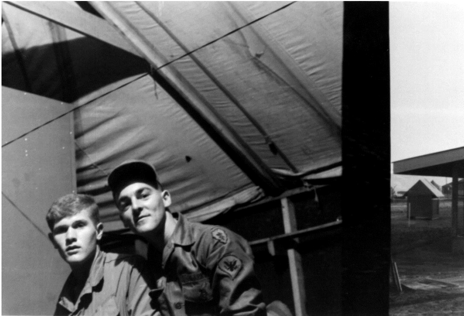
unk at Montezuma