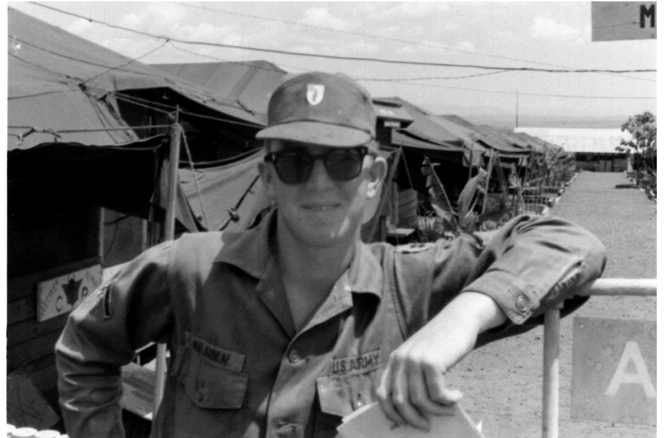
unk at Montezuma?