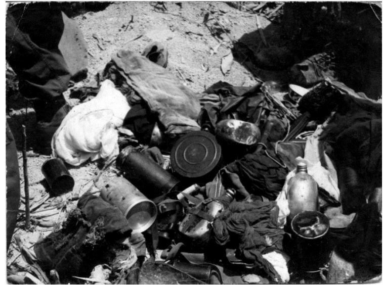
Mar 12, 1967 captured NVA gear round cylinder is magazine for NVA MG it carries 100 rounds all armor piercing and tracer