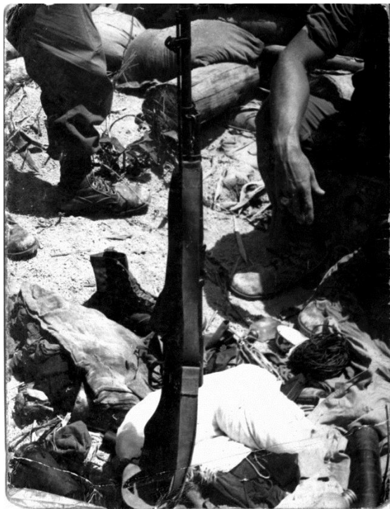
captured NVA sniper weapon plus NVA gear