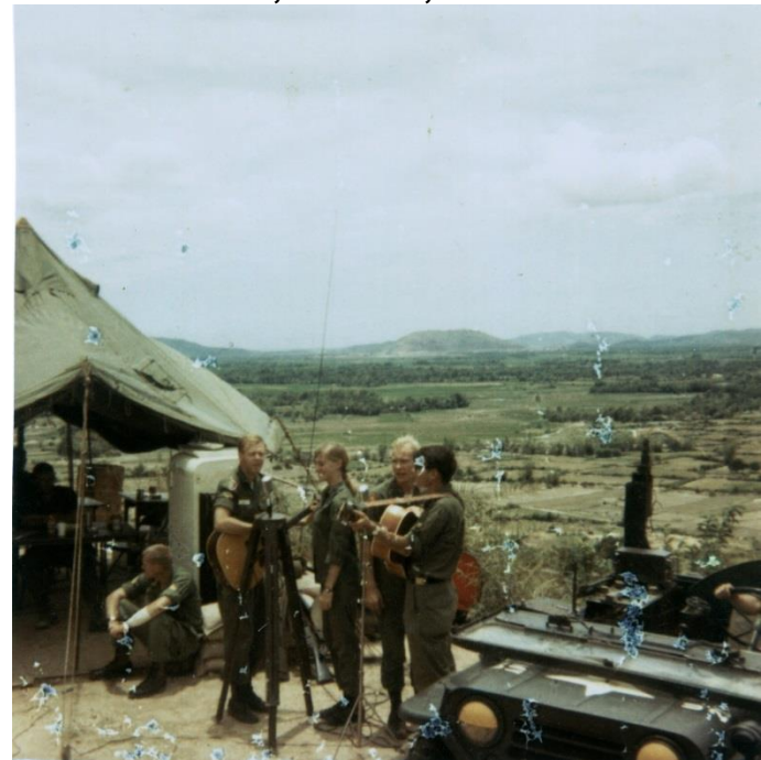
USO at Liz