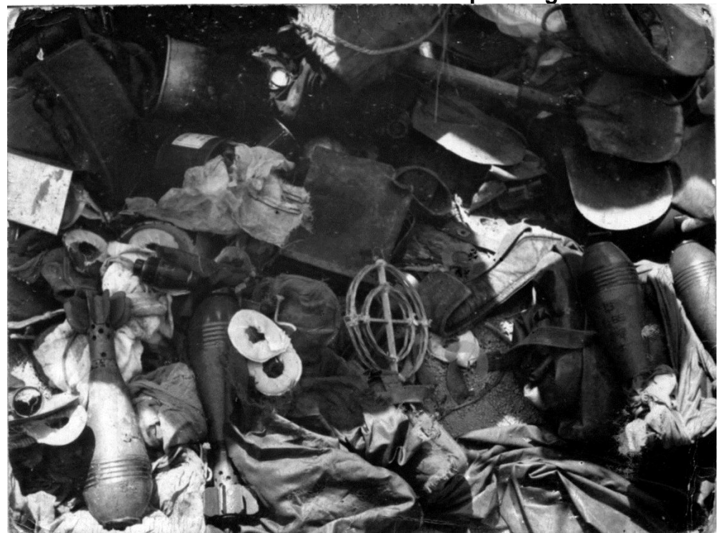
More captured NVA gear plus NVA mortar rounds