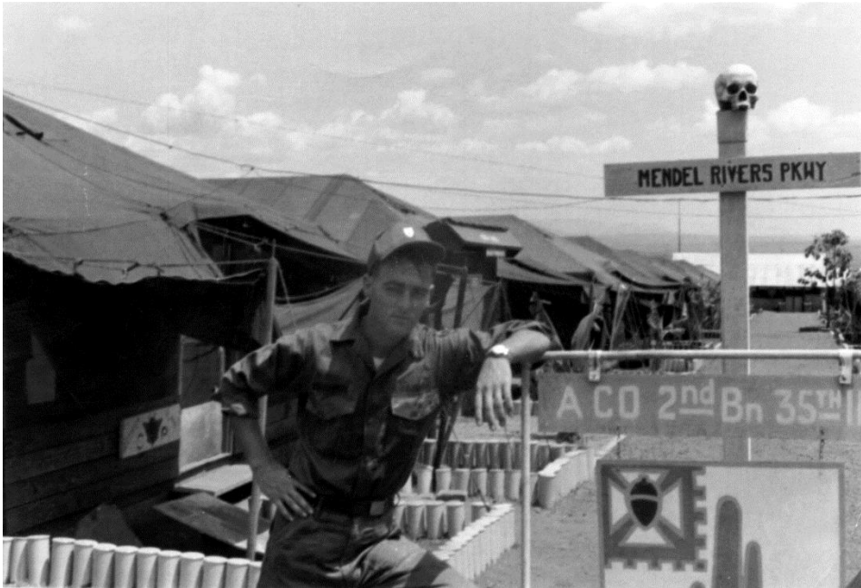
unk Co A