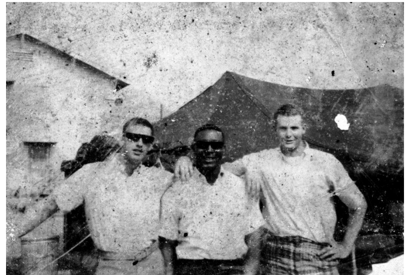
unk with Art