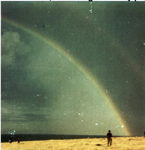
A Co on beach of S China Sea