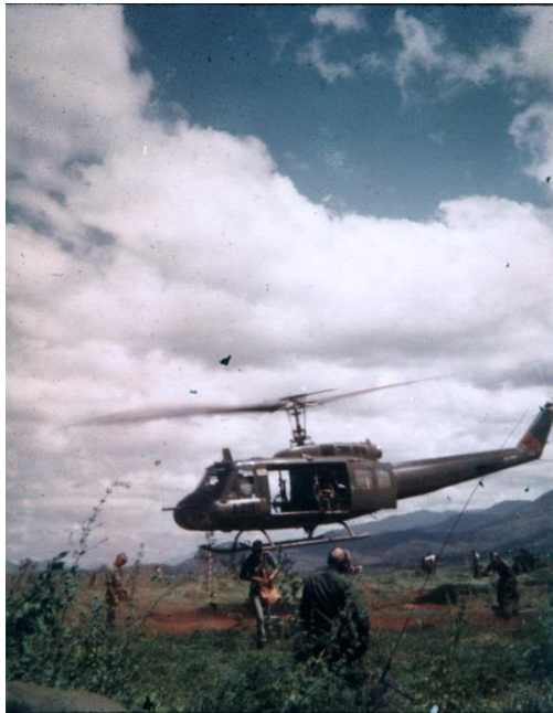
helo landing, unk loc