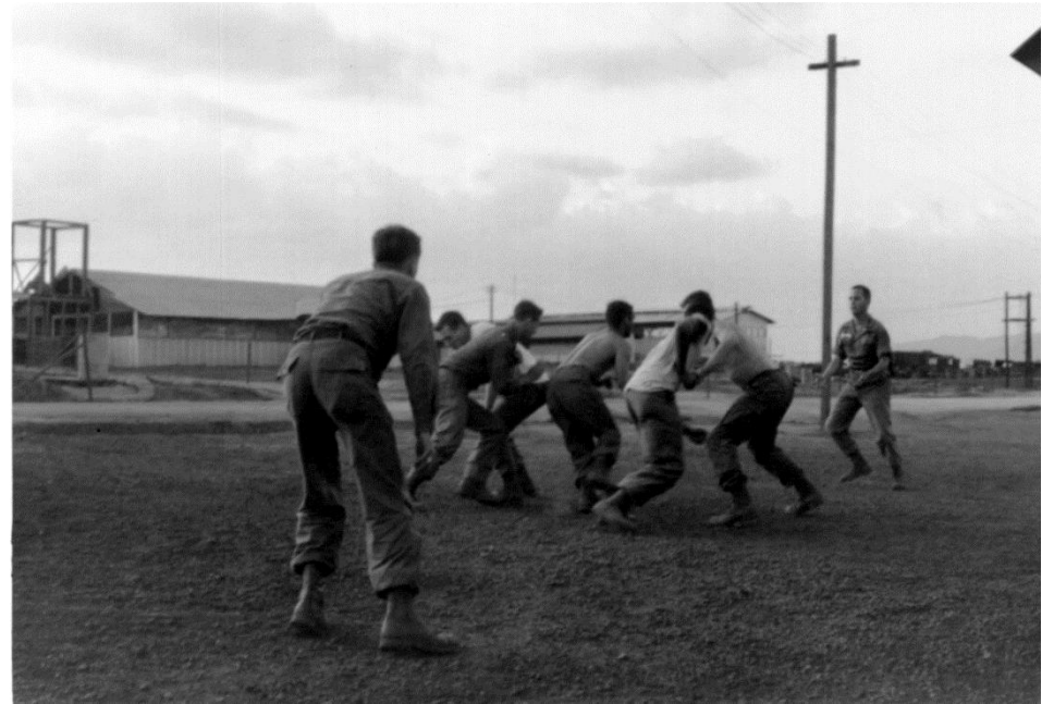
football at Montezuma