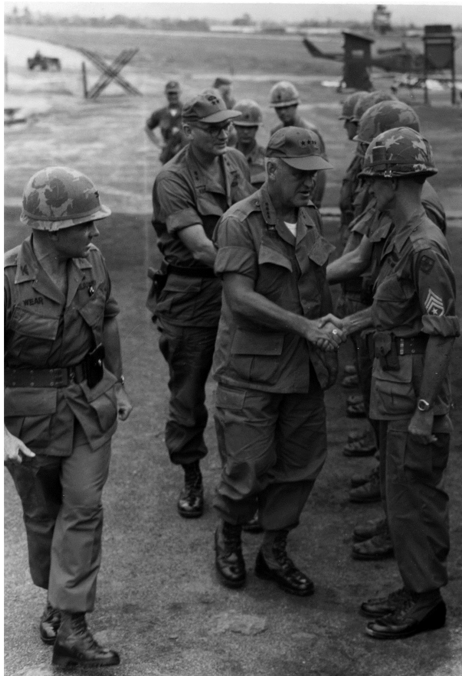
Col George Wear, CO 3 rd Bde Task Force with General Creighton Abrams