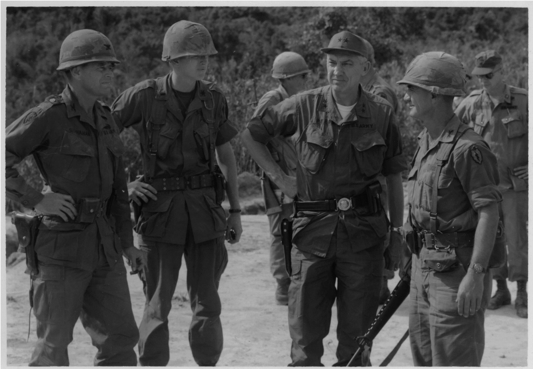
Col. Shanahan, CO 3 rd Bde Task Force with MG Peers, CO 4 th Division. MG Peers was CO of Det 101 OSS in Burma during WWII