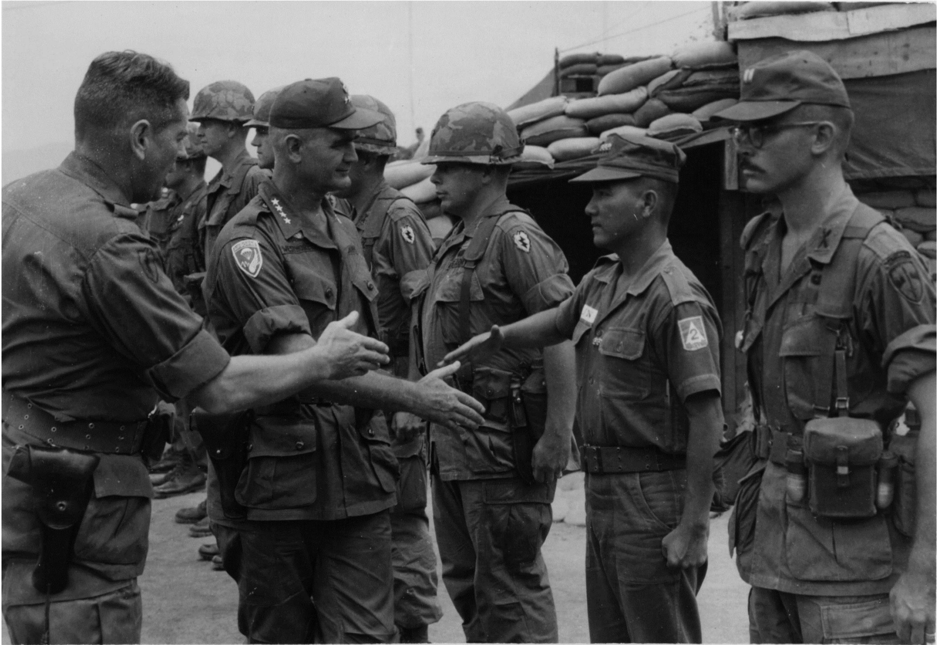
Col Shanahan with General Westmoreland at 3 rd Bde HQ – 1967