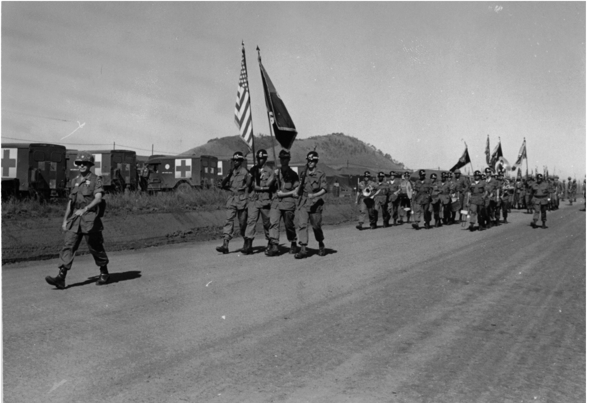
Photo probably taken at Camp Enari. Looks like Dragon Mt. In the background?