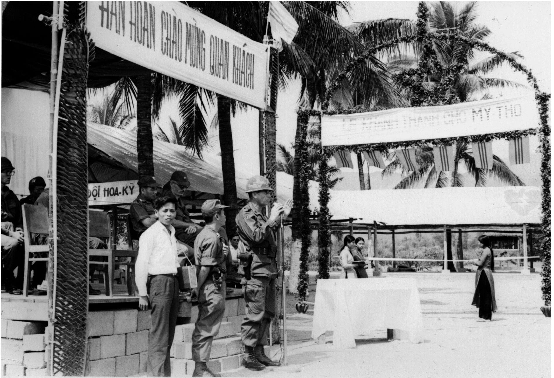
Col Shanahan CO 3 rd Bde Task Force