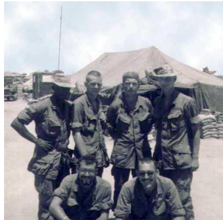
CO "B" Officers 2nd Bn. 35th Inf. 25th Div. June 1967