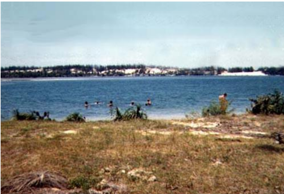
1st platoon B-2/35 taking a 30-minute break from the war. Near DucPho Vietnam April 67