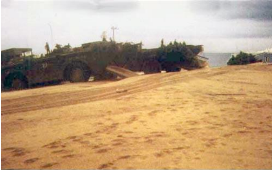
Unloading 1st platoon of B-2/35 after making a combat assault by sea. April 67