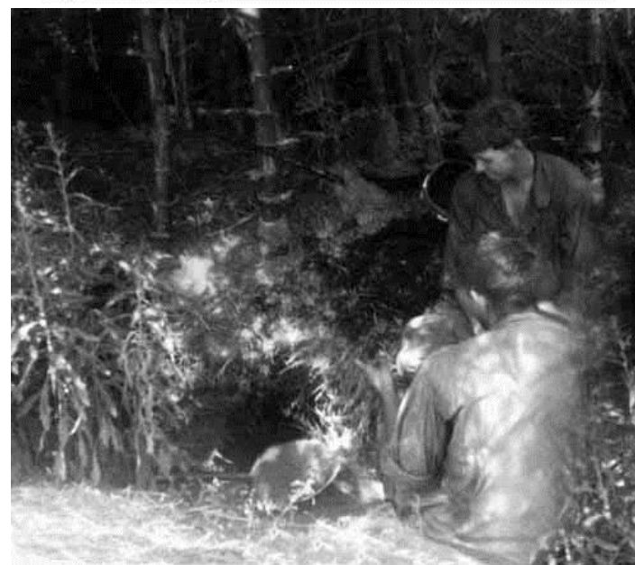
Resting after diggng "Charlie" out of hole 1st Plt. B-2/35 Inf. July 1967