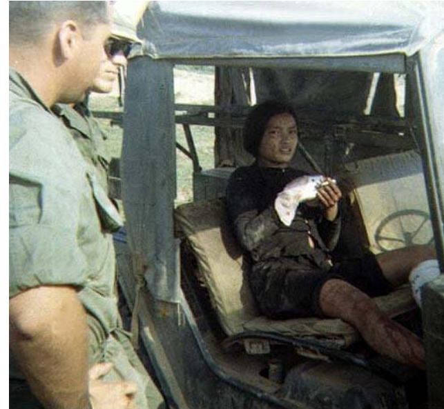
Female Vietcong captured after an assault on LZ Liz.