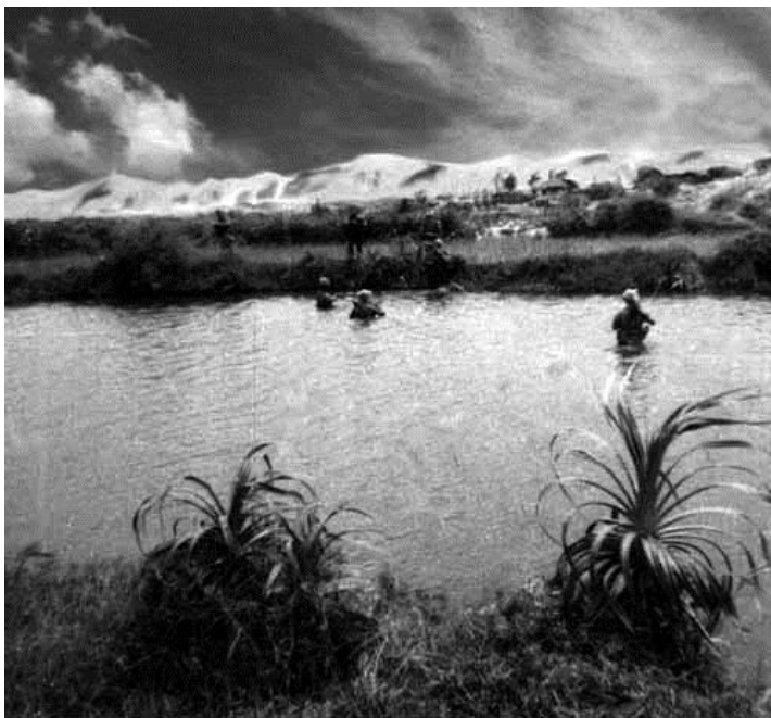
River crossing near Duc Pho Vietnam 1st Plt B-2/35 June 1967