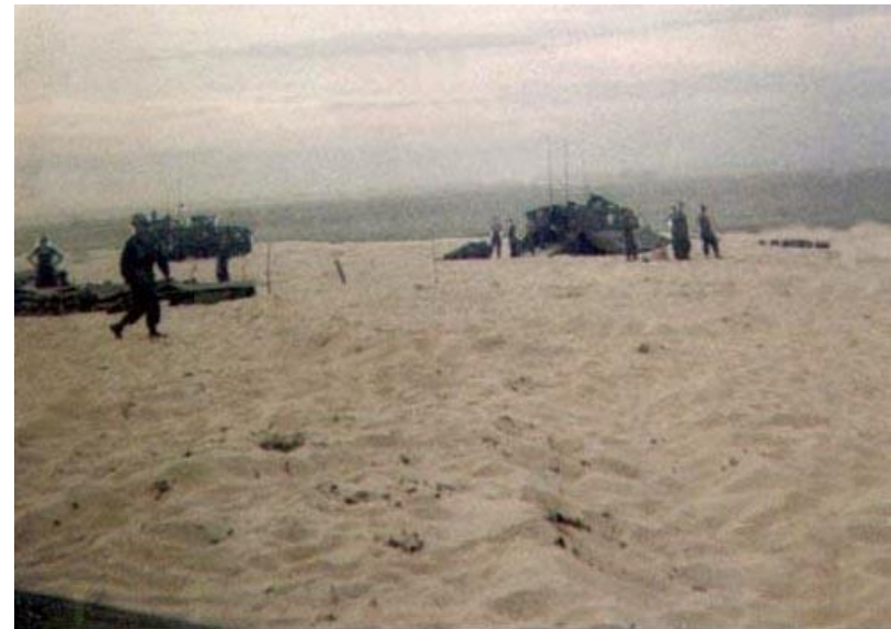
1st Plt. B-2/35 off loading from a Chinook helicopter on the beach. April 67