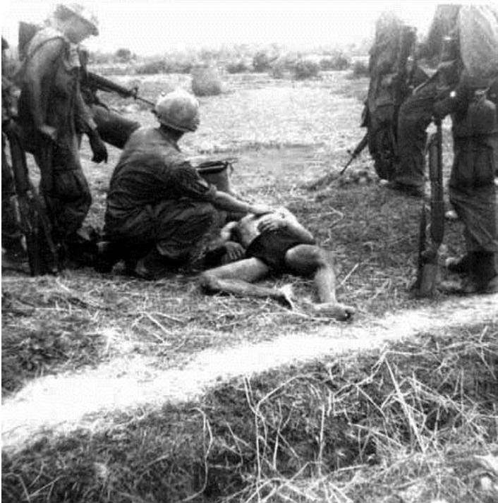
VC smoked out of tunnel 1st Plt. B-2/35 April 1967