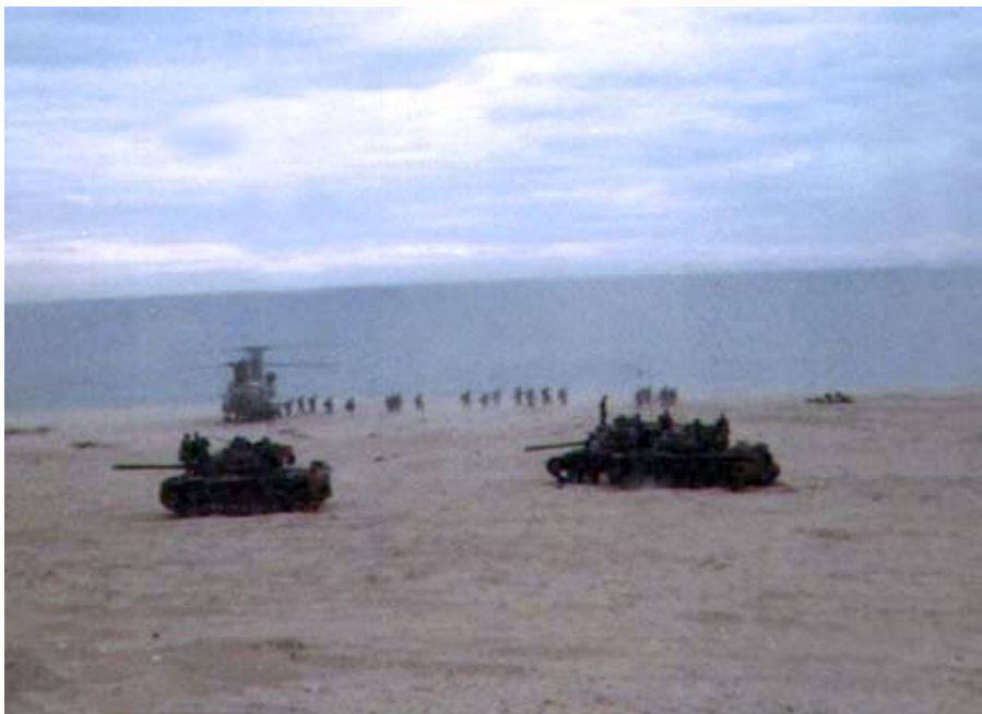
Co. B-2/35 spending the night on the beach with a Tank unit.