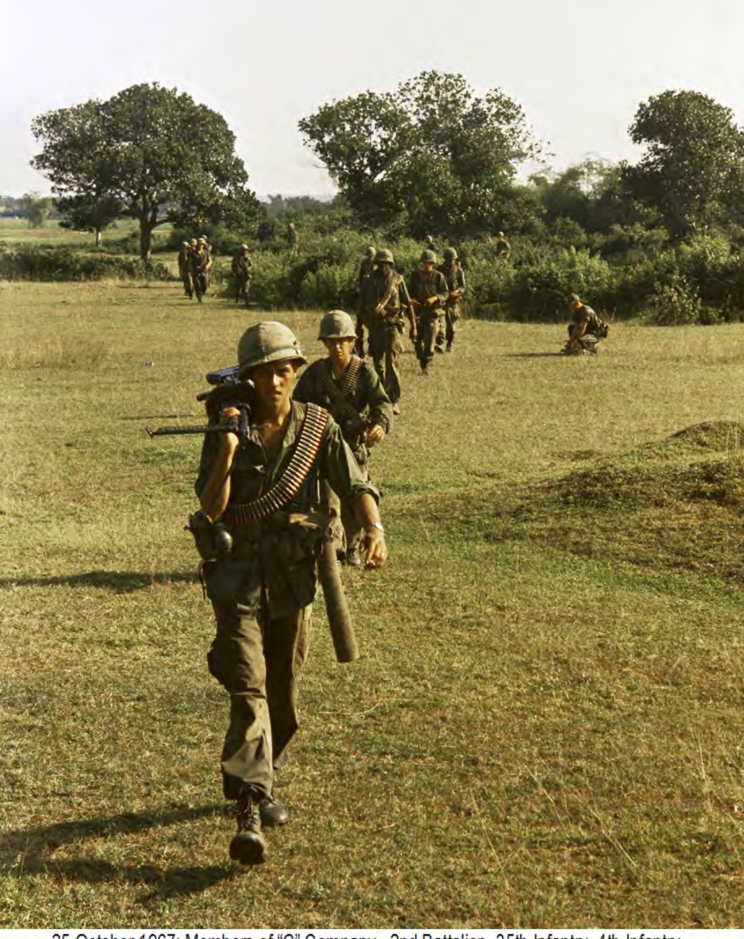
25 October 1967: Members of "C" Company, 2nd Battalion, 35th Infantry, 4th Infantry Division move across and open field towards their first objective. The company was on a search and destroy mission in the Quang Ngai Province approximately 22 miles NE of their base camp located in Duc Pho, RVN.