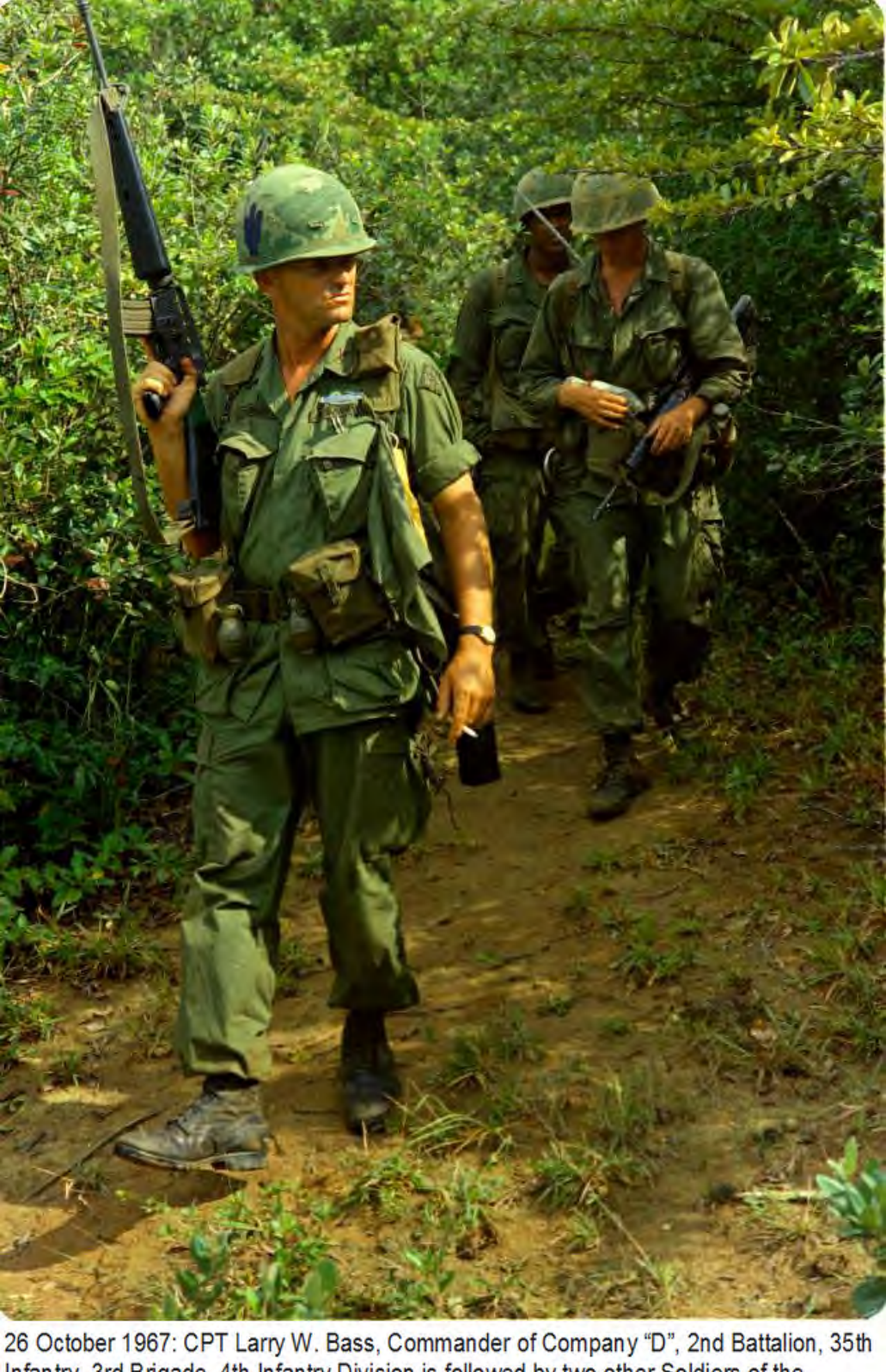
Infantry, 3rd Brigade, 4th Infantry Division is followed by two other Soldiers of the company. The three Soldiers are moving along a suspected enemy trail in search of Viet Cong/NVA Soldiers, their equipment and any other logistical supplies. This search and destroy mission was conducted in the Quang Ngai Province, 8 kilometers West of Duc Pho, Republic of Vietnam.