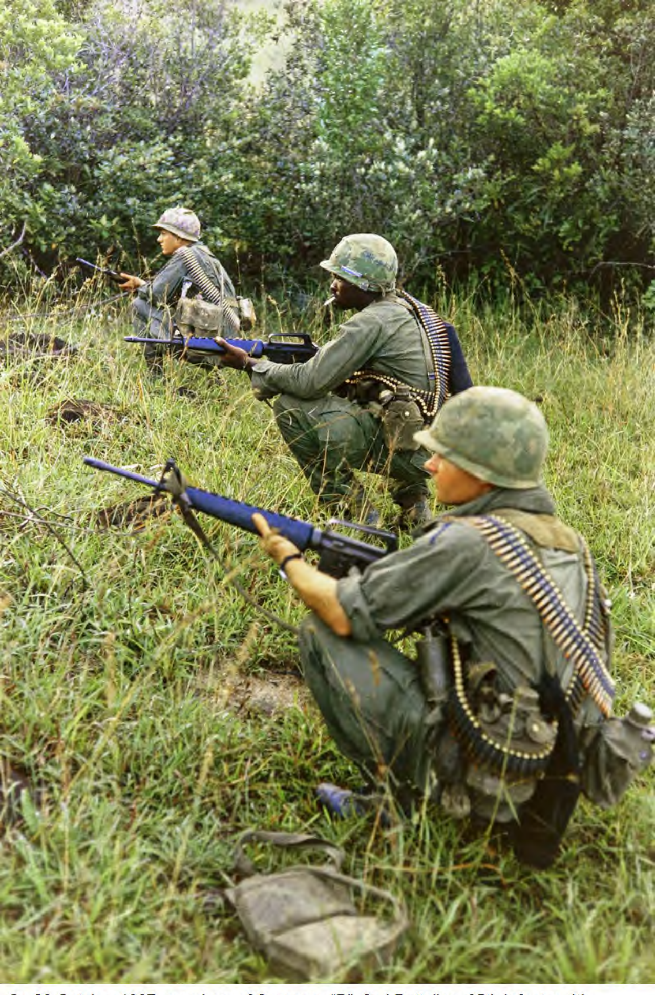
On 26 October 1967, members of Company "D", 2nd Battalion, 35th Infantry, 4th Infantry Division participated in a helicopter assault/search and destroy mission in the Quang Ngai Province 8 kilometers West of Duc Pho, RVN. Soldiers arriving in the first wave guard and secure the landing zone for follow on troops.