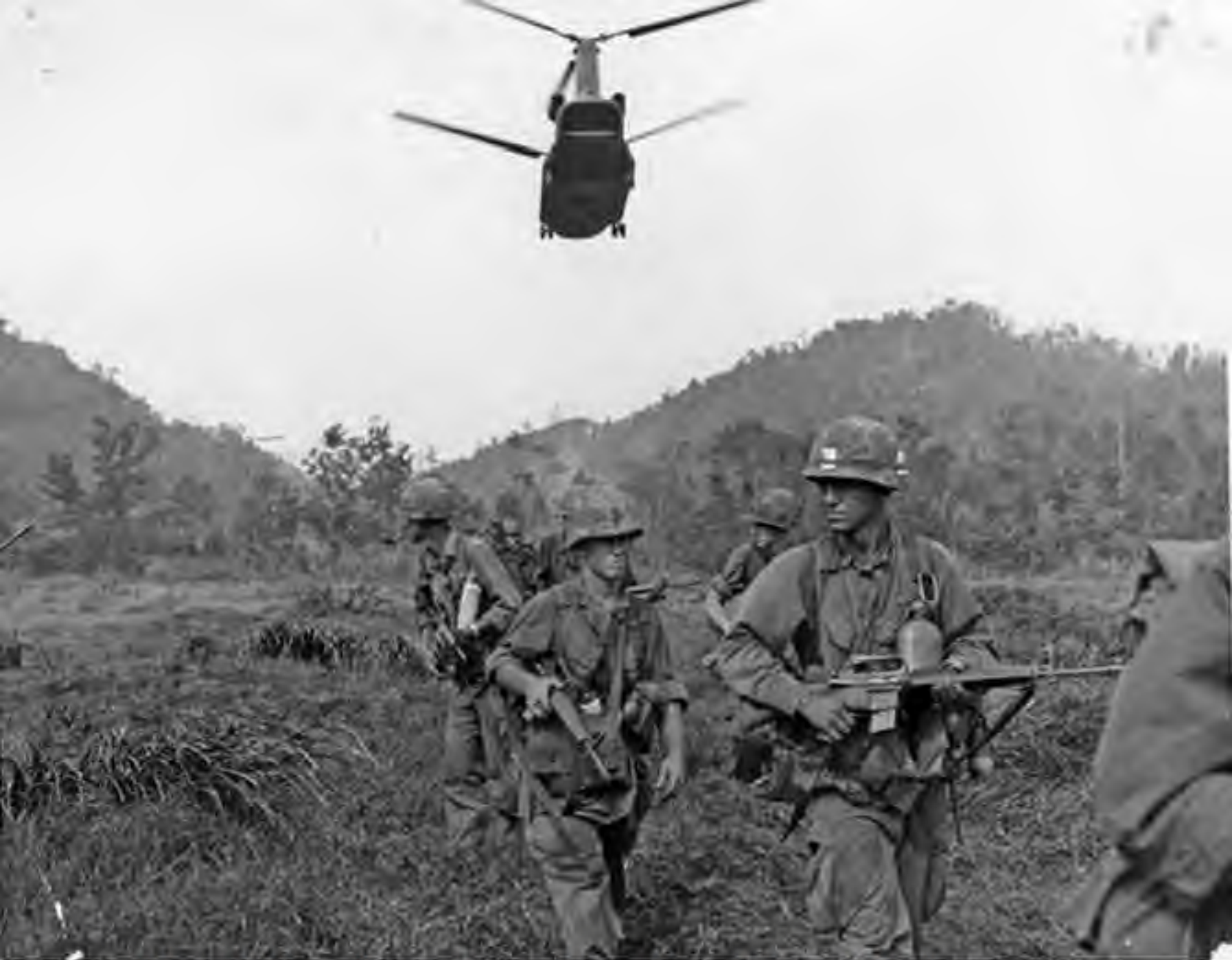
Members of A Co, 35 th Infantry Regiment move out against a suspected North Vietnamese Command Post north of Phu Cat as a CH-47 Chinook helicopter brings in more troops. 11 April 1967