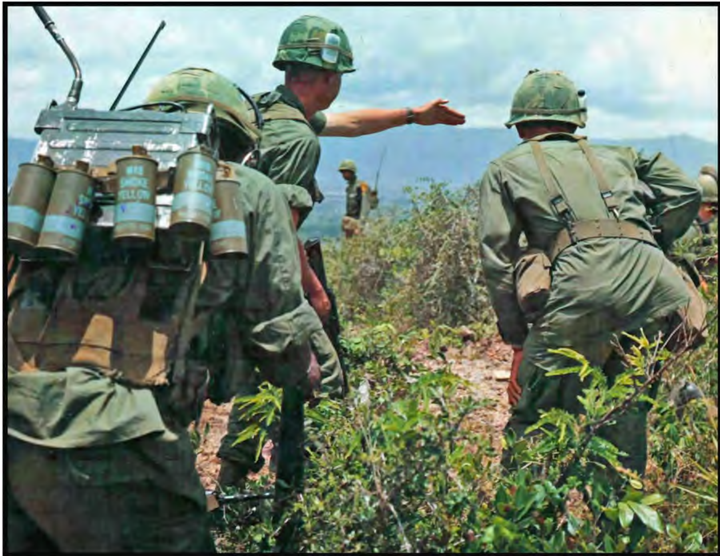
Caption: "An infantry platoon of Troop B, 1st Squadron, 9th Cavalry, 1st Cavalry Division, three kilometers west of Duc Pho, Quang Ngai Province"